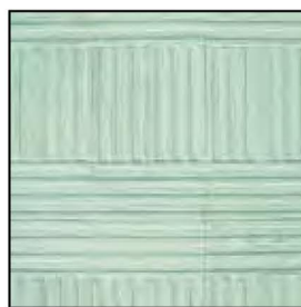
IW 003 Green