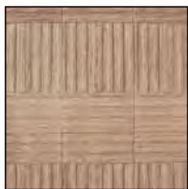
IW 001 Natural