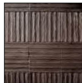
IW 004 Wengè