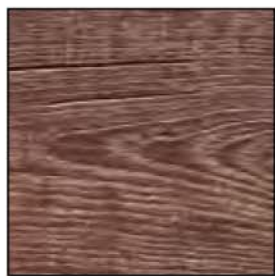
LI 001 SCU