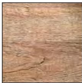
LI 002 NAT