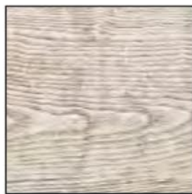
LI 003 DEC