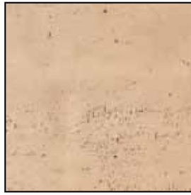
TR 002 Nut