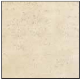
TR 001 Natural