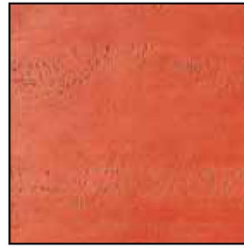
TR 003 Red